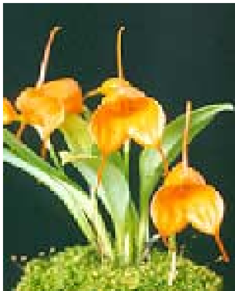
Masdevallia hirtzi 'Don'

growth is farthest from the edge of the pot, allowing the maximum number of new growths without crowding the pot. Plants growing in many directions may be positioned in the center of the pot. Spread the roots over a cone of potting medium and fill in around the roots with potting medium to the junction of the roots and the plant. Firm the medium around the roots by applying pressure. Keep humidity high and the potting medium slightly dry until new roots form. A vitamin B1 compound may help establish newly potted plants.