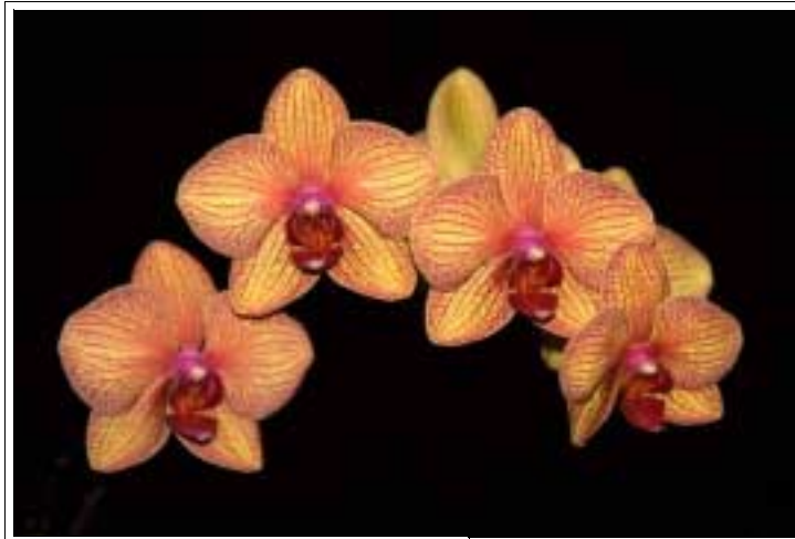
Phal. Baldan's Kaleidoscope

POTTING is best done in the spring, after blooming. Phalaenopsis plants must be potted a well-draining mix, such as fir bark treefern, various types of stone, sphagnum moss, or combinations of these. Potting is usually done every 1 to 3 years. Mature plants can grow in the same pot until the potting medium starts to decompose, usually in two years. Root rot occurs if plants are let in a soggy