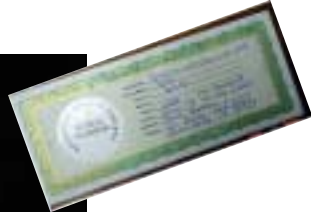
Dracula marsapialis 'Bette' , James Nybakken, Botani- cal Recognition