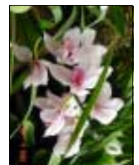
Some Blue Ribbon Winners from the MayFaire