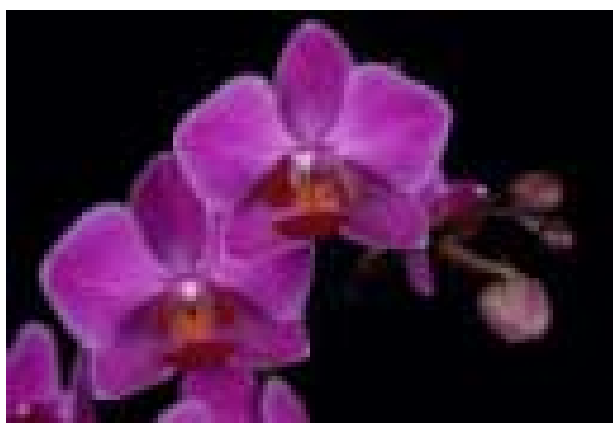
Phal. Taisuco Pixie