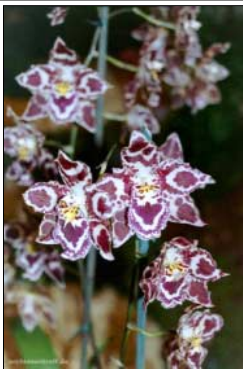
Odontoglossum Margarete Holm

Prepared by: Education Committee, American Orchid Society, 6000 S. Olive Ave., West Palm Beach, FL 33405 (407) 585-8666.