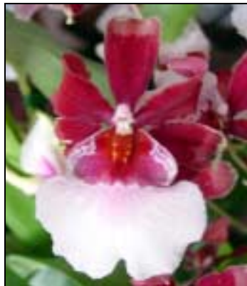
Mtdm. Bartley Schwarz. Highland