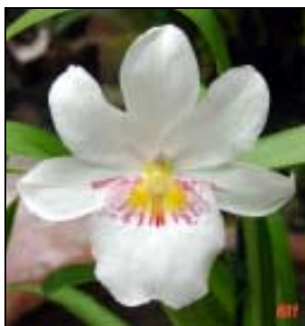
Milt. Lady Snowx Lorene