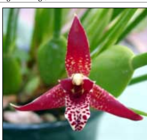
Max. tenuifolia (Coconut Orchid)

When dividing Oncidium Alliance plants, always divide into parts with four pseudobulbs. Remove any dead roots from the divisions, then lay the divisions aside until new root growth begins. At that time, usually a week or so, repot the divisions in their new pots. Now the plants can be watered and fertilized as usual without worrying about rotting them, because they retained no roots in the division. Newly repotted plants should be placed in slightly lower light for several weeks.