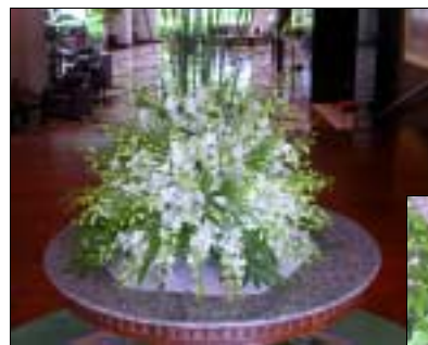
More blooms from Thailand, Rose Garden Hotel.

Now, this rule will have to be amended depending on humidity and potting material, but there's a good place to start, don't you think?