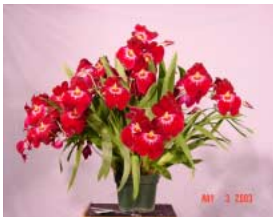
Miltonia from 2003 MayFaire: AOS Award

formulation is beneficial in early spring when plants approach their flowering period. POTTING should be done after flowering when the new growth is starting. Miltoniopsis should be repotted every year as they are intolerant of stale conditions. The cool growers ( miltoniopsis ) do well in small pots. The warmer growers ( miltonias ) tend to have a relatively elongated creeping habit