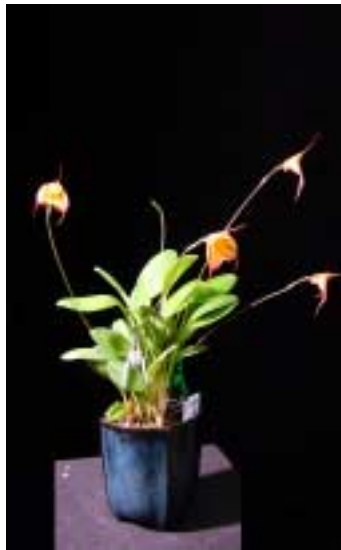
AOS awarded masdevallia