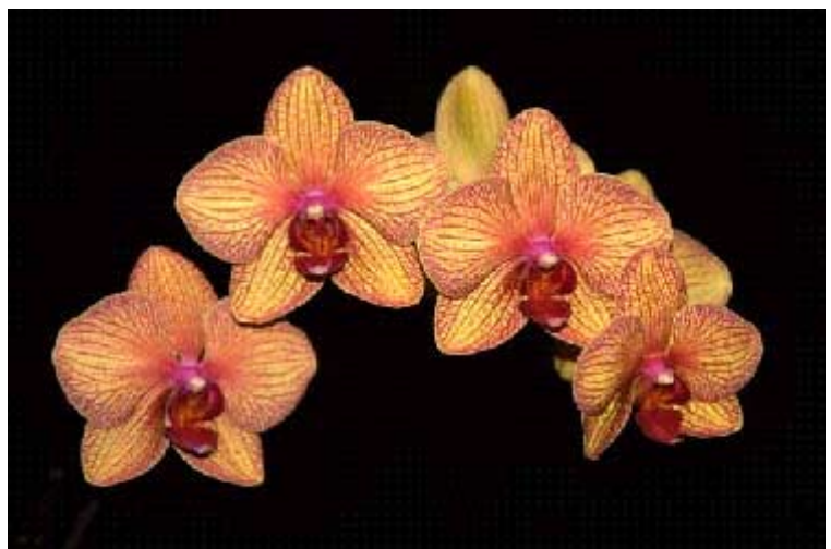
Phal. Baldan's Kaleidoscope

For more information and to sign up, please call Peggy Purchase at (408) 624-8442.