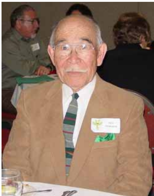
More COS Christmas Party 2004