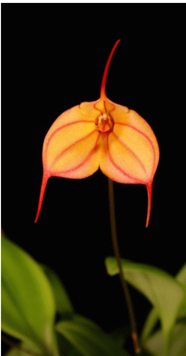
Masd. Rise 'N Shine 'Mountain side' Marni Turkel Award of Merit Mayfaire 2003

F E R T I L I Z E regularly with a dilute solution while plants are actively growing. Applications of 30-10-10-type formulations twice a month are ideal for plants in a bark-based medium. A 20-20-20-type formulation should be used for plants in other media. If weather is overcast, applications once a month are sufficient.