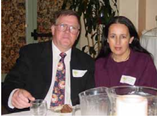
COS Christmas Party 2004