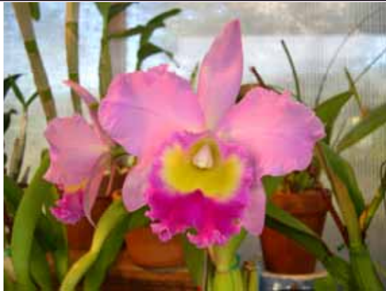
See page 6 for Details.