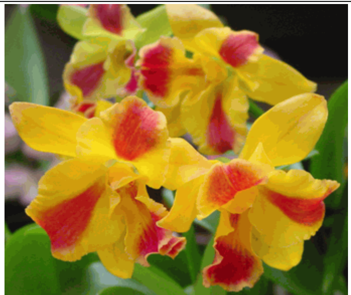
Pot. Burana Beauty 'Burana #4' MayFaire 2003