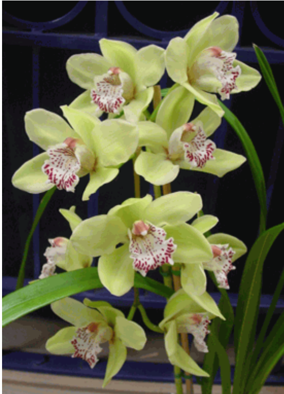
Cym. Rumbles 'Emerald Fire' Bakkenelle Orchids MayFaire 2003