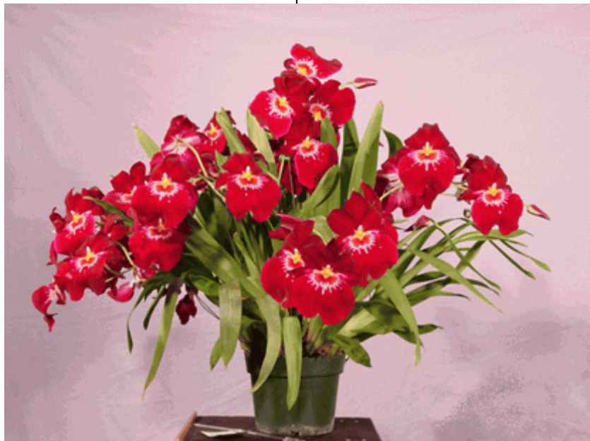
Milt. Patricia Anne 'Max' The Orchid House, Los Osos, CA MayFaire 2003 AOS CCM

tleyas; allow them to approach dryness between waterings. They also tend to be slightly more tolerant of salt buildup than their Colombian cousins so they can dry more between waterings.