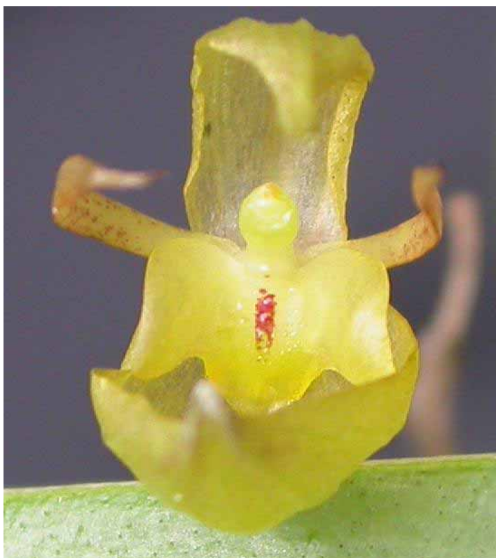
Pleurothallis excentrica 'Beta' CBR