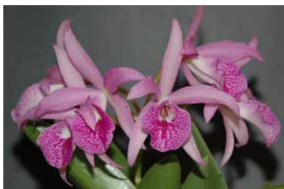
Images from the Greenhouse Tour BBQ Plant Table