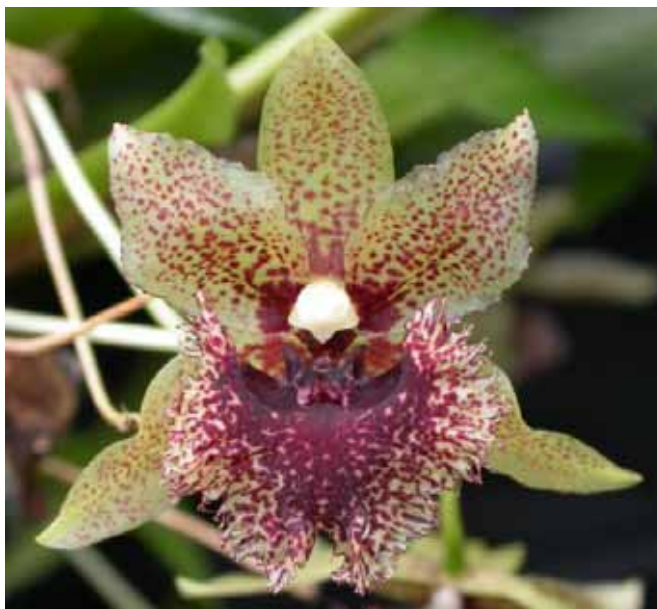
Kefersteinia tolimensis 'Beta' HCC 77

October 12-16, 2005 10am to 5pm Doubletree Hotel Sonoma Wine Country, Rohnert Park, CA Info: (707) 528-1671 www.orchidweb.org/aos/events/ members.aspx