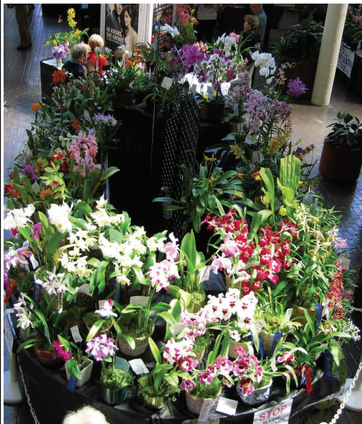
Plant Display 2007 MayFaire American Tin Cannery