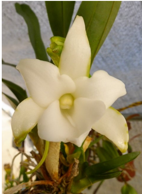
Angraecum magdalenae , fragrent!