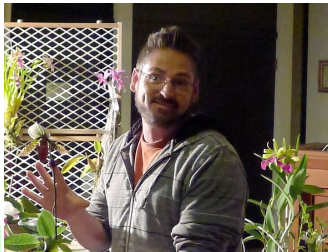
Even new members have plants to show off.

The next meeting is on Monday December 3rd, 7PM at the Community Church of Monterey Peninsula. 4590 Carmel Valley Rd.