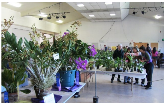
Scenes from the Santa Cruz show