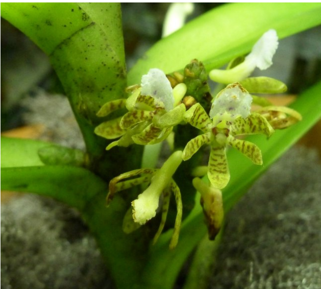
Acampe praemorsa, aquired at the Santa Cruz show in November.

Sooner or later every orchid addict seriously contemplates a greenhouse. Maybe the available growing spaces in the house get a bit crowded or maybe the it's allure of a controlled growing space where you don't have to worry about the walls, flooring, spouse... Some lucky people go whole hog right off the bat with 200+ square feet of climate controlled growing space, others start out small, cheap or both. That's me, four years ago I bought a 8'x8' polyethylene covered hoop type greenhouse for around $200 and moved about half my collection into it for the summer. With the addition of a little heat, during the last couple of winters an increasing number of my plants have made it their cold weather home too.