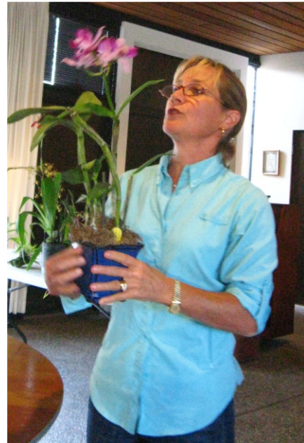
"I love my cat's"