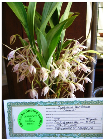
Cymbidium lancifolium 'cammie' CCM/AOS I had to give this a clone name for judging

So based on my experience so far I expect the goeringii to bloom in the spring, and I should pick up a kanran, another somewhat difficult one, since I seem to be able to make the difficult ones grow and bloom while the easy ones are difficult.