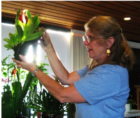
"This grows under my deck..."

Bring cash or a checkbook, these are some very cool plants!