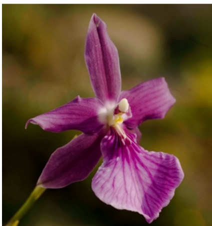
A bloom from the Miltonia.