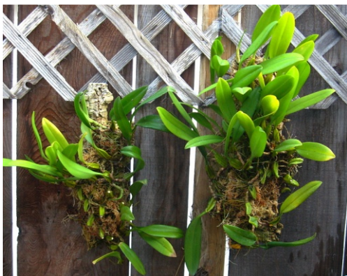
The Cirrhopetalum, on the split mount.

crossed the split. With that done, it was just a matter of wrapping the dangling ends up onto the mounts and tidying up a little.