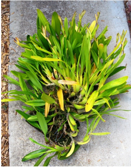
In the beginning...