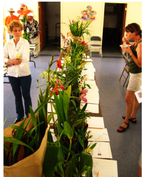
Silent auction at the Summer Orchid Fest