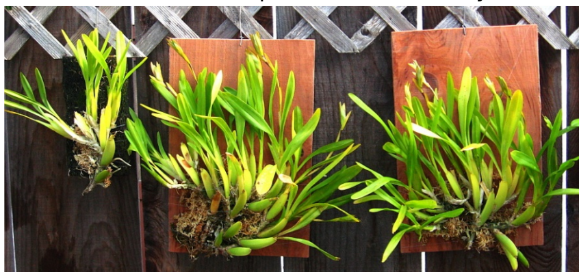
The Miltonia's on the new mounts.

P.S. A week or so later the Miltonia buds started opening, the flowers look a lot like Miltonia spectabile.