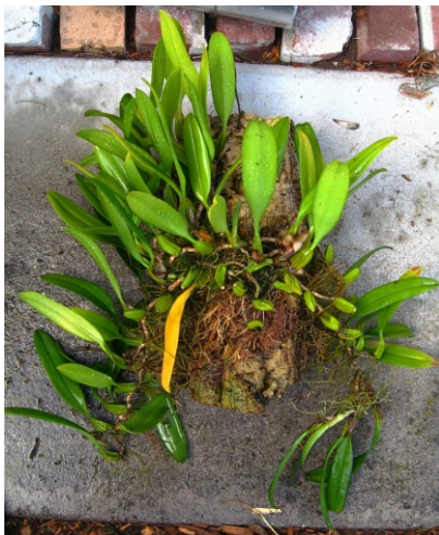
The Cirrhopetalum , on the original mount.

on deadline, so I didn't have time to acquire large enough pieces of cork. Home Depot to the rescue, I found a 12" wide Redwood fencing board from which I could cut a couple of 18" pieces that would work. Redwood is perhaps not the most ecologically sound choice, but it is the most rot resistant wood they stock (cedar would be another top choice). Two smaller leftover pieces I mounted on some treefern and a branch.