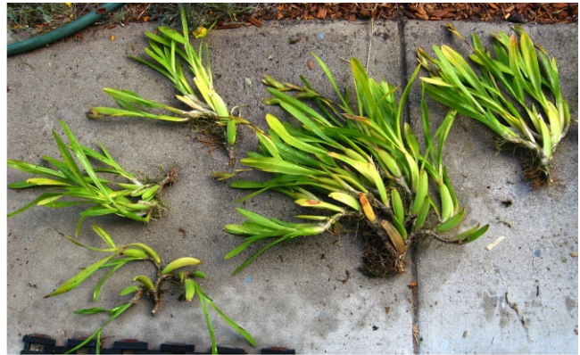
The Miltonia , removed from the mount.

much persuasion as I could muster, and brute force when persuasion failed, I pull the Miltonia free of the mount. The result was not two equally sized pieces, since the customers wanted roughly equal sized plants and didn't care if I combined pieces, I decided to mount the large piece by it's self and combine three of the medium sized pieces for the second one. Now what to mount them on? I didn't have any mounts large enough, and I was