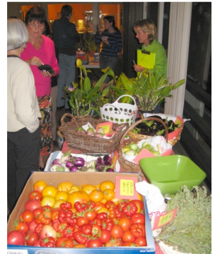
Some of us grow more than orchids! Veggies at the COS Flea Market & Auction