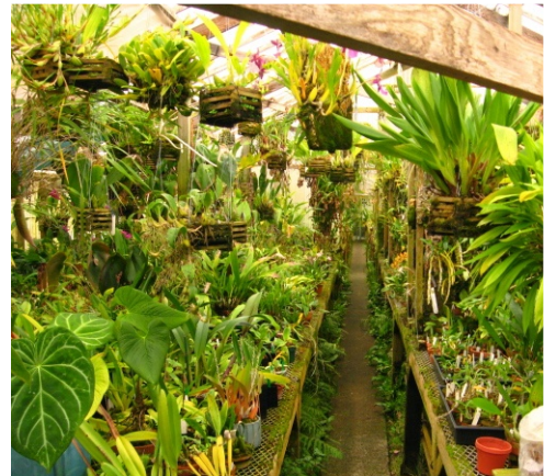
More pictures from Dan's greenhouse.