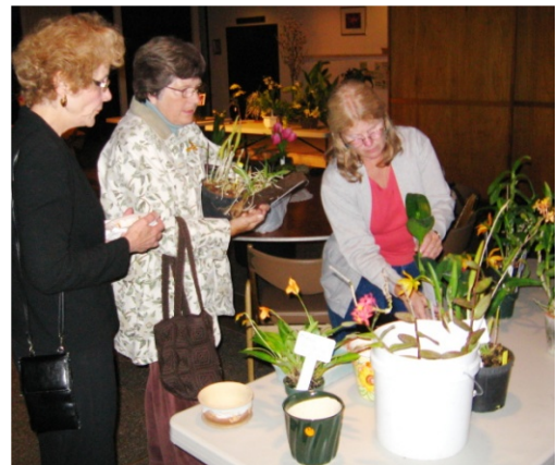
What every vendor wants to see: shoppers!