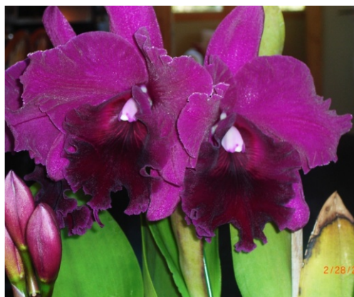
Guanmiao City 'Black Flower' Rhyncattleanthe Molbeth x Rhyncholaeliocattleya Chen's Ruby

It's that time again, time for your otherwise nice, friendly society board members to nag you about paying your membership dues. As much as we would like to have your money to pay for our fabulous monthly speakers, what we really want is for you to come hear the speakers, buy the raffle tickets and take home all the interesting plants on our monthly raffle tables. None of that will happen if you are not interested enough to pay the pittance we ask for or yearly dues. Most orchids that we will kill in less than a year cost more than a years membership! So all we ask is that you pay your dues, come to the meetings and have a wonderful time!