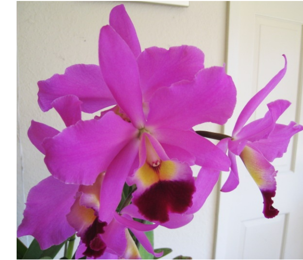
LC Honey from the Hale Collection