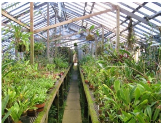
Hawk Hill Orchids (below) and Hanging Gardens (above).

Instead of an August meeting, we will be skipping town and heading up to Half Moon Bay and Pacifica to visit three well known growers. This is a great opportunity to visit 3 amazing greenhouses, talk to some of the best orchid growers in the Bay area and buy some very cool plants. We will be visiting: