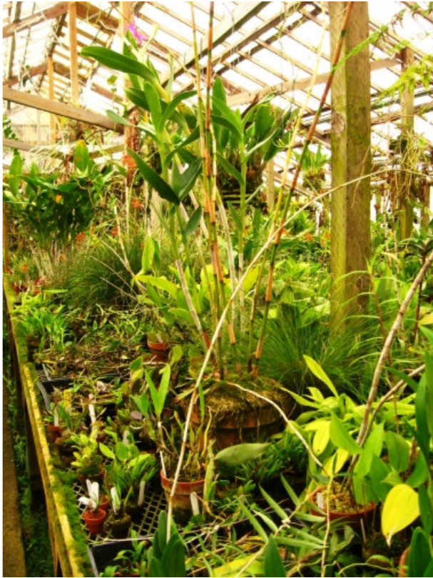
Just a few of the incredible number of plants in Dan Newman's greenhouse.