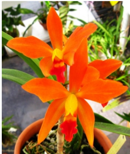
Cattleya Ginny Champion 'Prince'

My cool growing masdevallias are starting their new growth and spikes