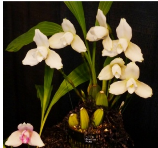
Marni Turkel's exhibit at POE was incredible. This Lycaste skinneri alba was great.

With the advent of spring most of the bay area orchid shows are over, but our show