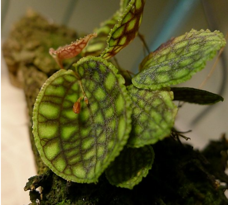
2 from John's wardarian case (an old aquarium) Above: Lepanthes calodictyon . Brought back from near death. It likes it inside and very moist. Below: Pleurothallis endotrachys . Orange and fuzzy!