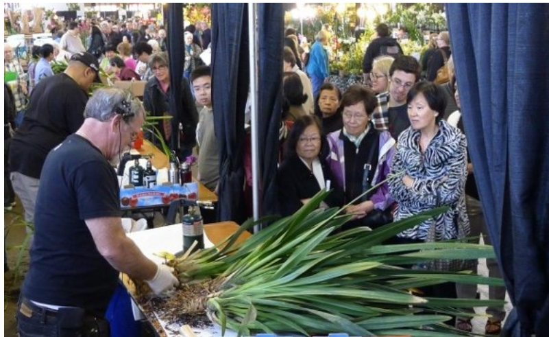
The Cymbidium division and repotting demonstrations are always popular at POE.