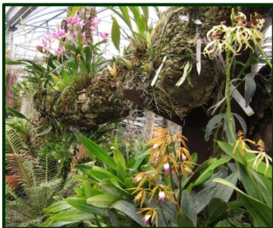
Our outdoor orchid logs in full bloom, Jan. 2012