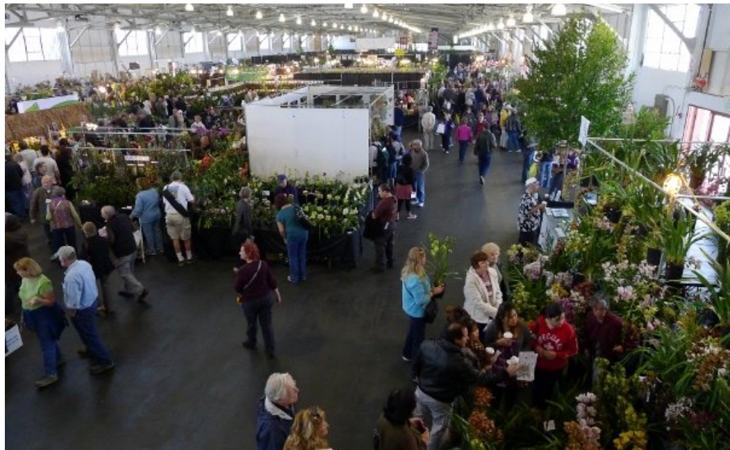
POE, getting crowded.

4/21-22 Sacramento Orchid Society Show and Sale, Scottish Rite Temple, 6151 H Street, Sacramento