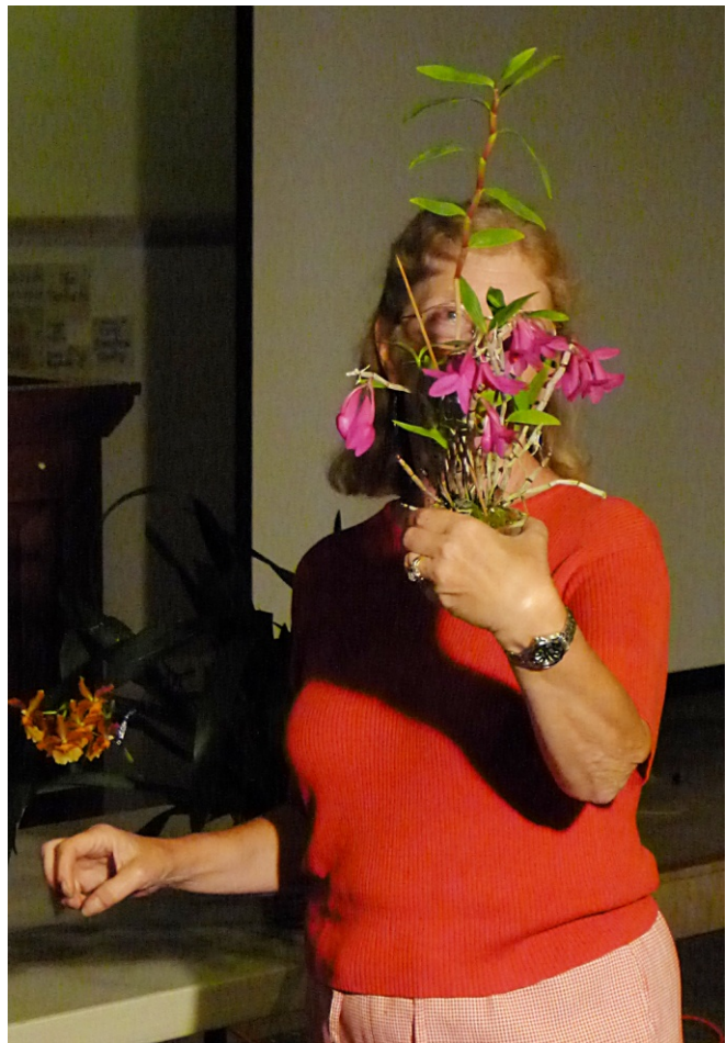
Bought at member sales or ready to be sold at member sales?