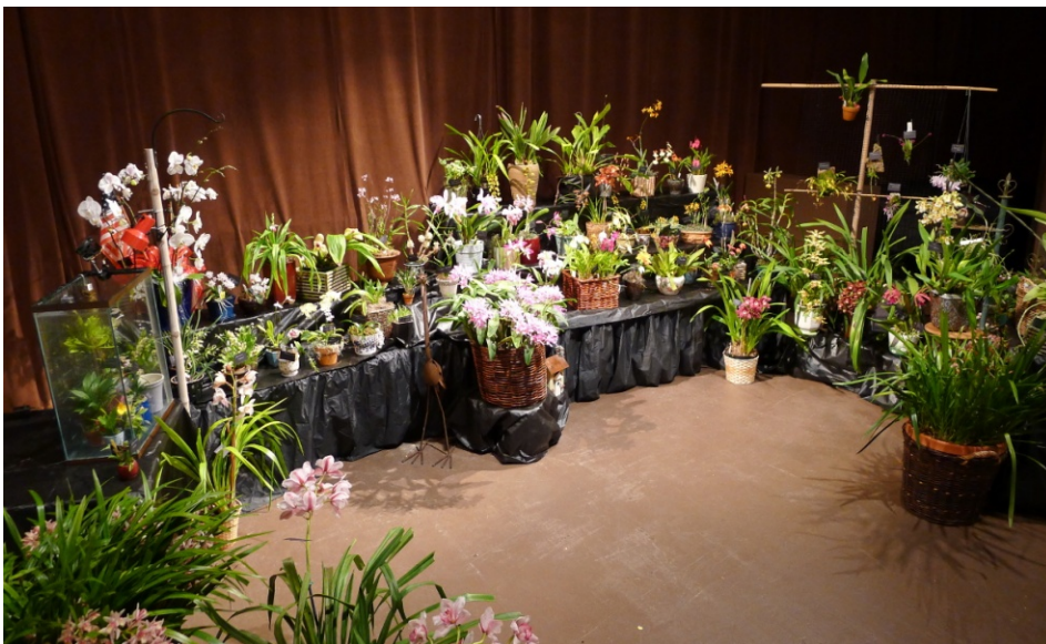
2011's CVGS display

November 9th. We must be out of the Hall early Saturday evening. Nothing can be left at the Church. We urge you to come a little early to help us by assisting with clean up. . Many hands make light work for all! See you there!