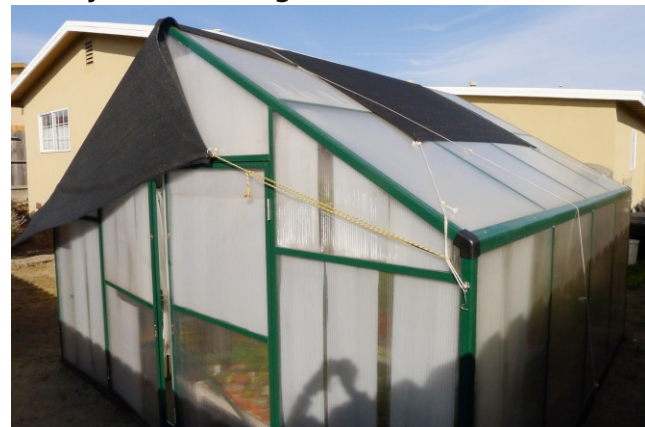
Some of the shade cloth. Also notice the backdoor which is being opened with the new automatic opener

and some of the walls with it and it provides a nice bright diffuse light but it only cuts the light from 7000 fc (foot