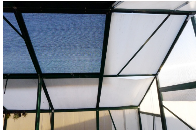
The white twin-wall used to diffuse the sunlight

Shade took some time. Carolyn had some translucent vinyl twinwall that she wanted to get rid of so I took a bunch of it and cut it so it fit between the frame members. I covered the roof