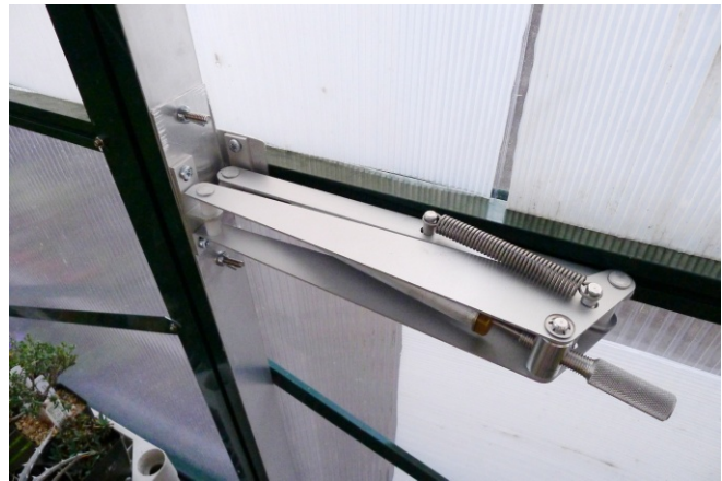
The automatic opener for the back door. It has three springs to close the door with.

adding another automatic opener to the back door. The combination of automatic vents on the roof and ground level seems to keep the temperatures