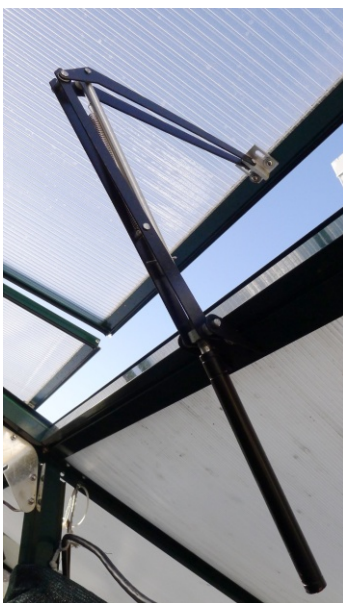
An automatic opener

But before the tweaking I had to finish the vents and provide some shade so I