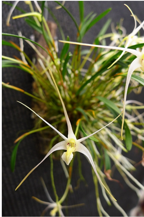
Diplocaulobium tentaculatum, The blooms only last a day, but the plant is covered with these neat spidery blooms.