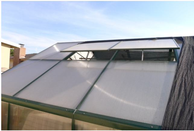
Two of the roof vents with the automatic openers.

Anyone with a greenhouse will tell you that getting the walls and roof up is only half the work. After you raise the roof you have to provide shade, ventilation, heat, water, electricity, and light. So here I am three months later and I am still fiddling with it, and I suspect that I be tweaking and improving things for a long time.