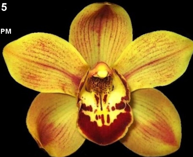
Cym. Tower of Fire 'Flambe'

San Mateo Garden Center 605 Parkside Way San Mateo, CA 94403