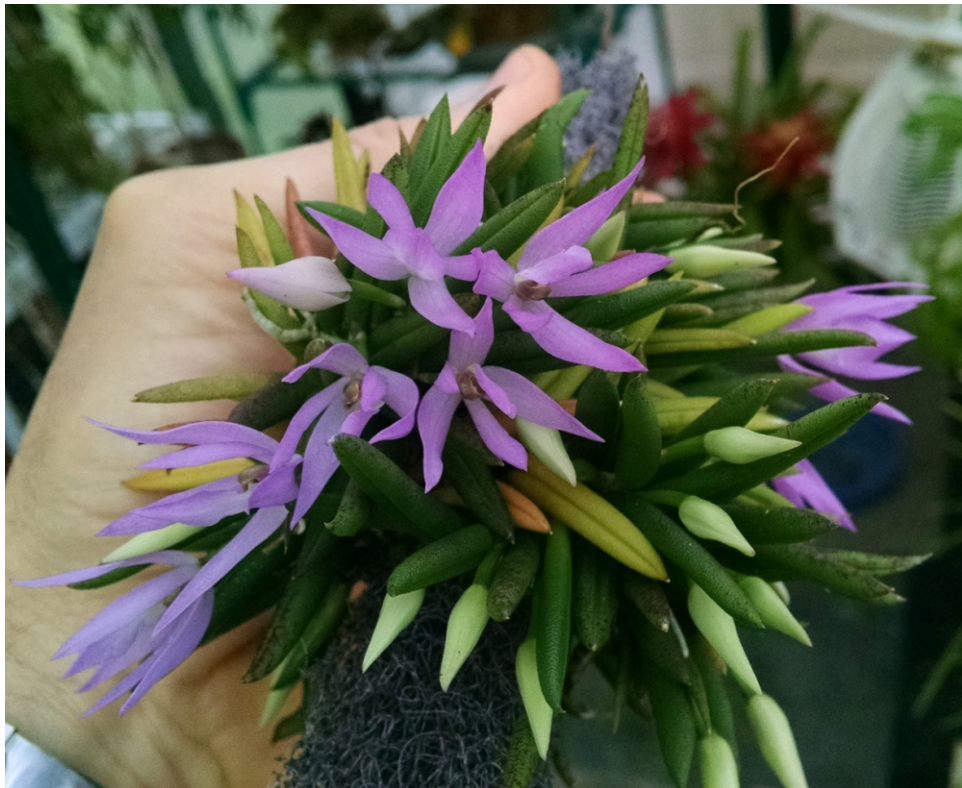
Leptotes unicolor, less known and smaller cousin of Leptotes bicolor.

2/20-23 POE Fort Mason Center San Francisco