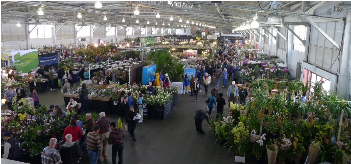
POE is huge!