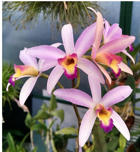
A Mystery Catleya from the Drummond Estate