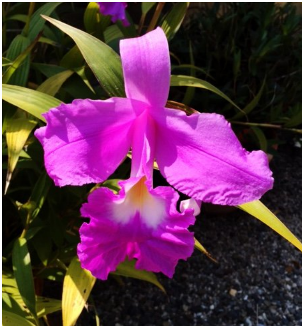
An unidentified Sobralia from Carol's collection.