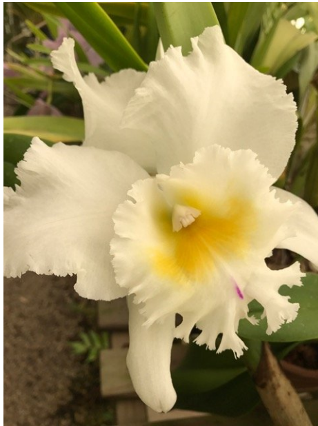
BC Pastoral Innocence, grown by Carol Easton