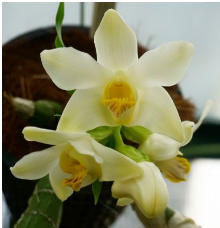
Chysis bractescens in John's greenhouse