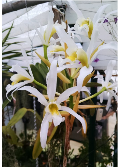
Myrmecophila tibicinis (alba) in John's greenhouse, the spike is 3 feet tall.

7/22-23 SFOS "Orchids in the Park" Summer Show & Sale Sat. & Sun 10-5, SF County Fair Building (Hall of Flowers) 9th Ave & Lincoln Way - Golden Gate Park, San Francisco