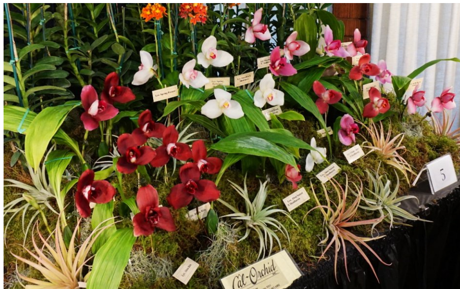
Lycastes, in the Cal-Orchid display, Peninsula Orchid Show last January