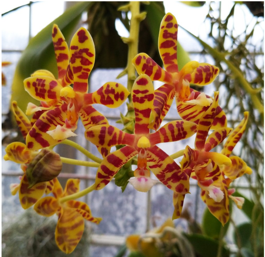
A nice little Phal. sp. in Carol's greenhouse