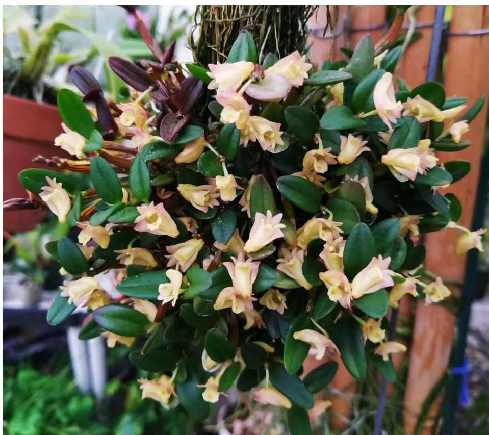
A nice little Dendrobium species prone to mass blooming in John's greenhouse