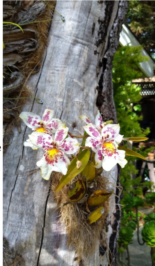
If you mount your orchids to trees (Picture from the COS BBQ at Irene and Rudy Patton's house) you are going to have a hard time selling them later.