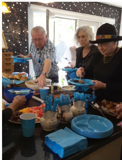
Left, Food and fun at the COS Fall BBQ