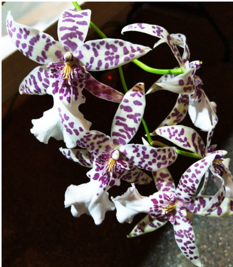
Left: an Odont. hybrid at the November meeting.