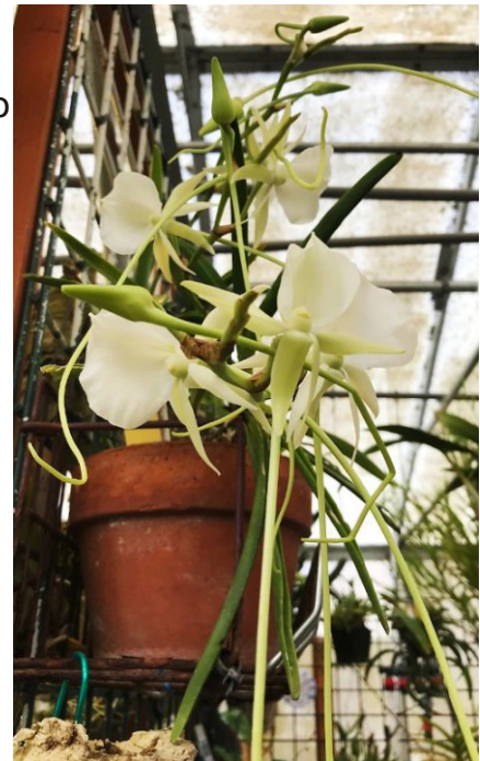
Angraecum longiscot in Carolyn's greenhouse, via Instagram