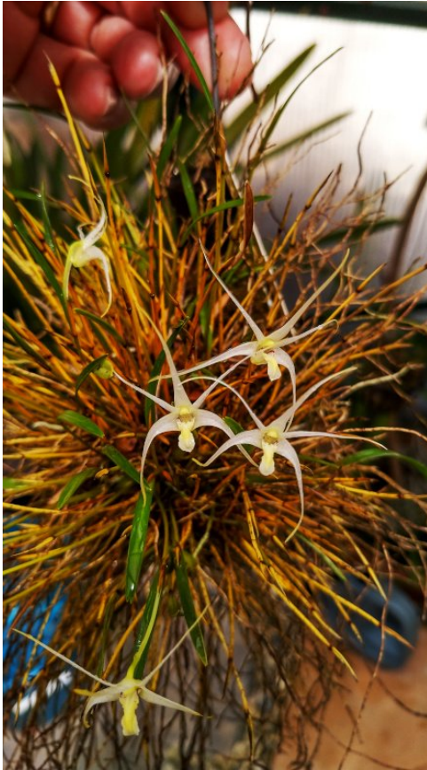
Diplocaulobium tentaculatum in John's greenhouse. This one blooms for only one day and it's gone.