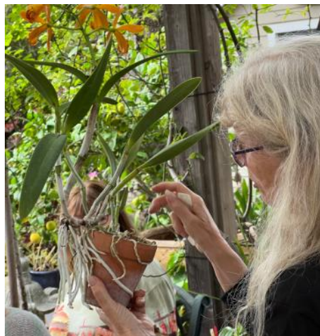
Raffle table action at the September BBQ