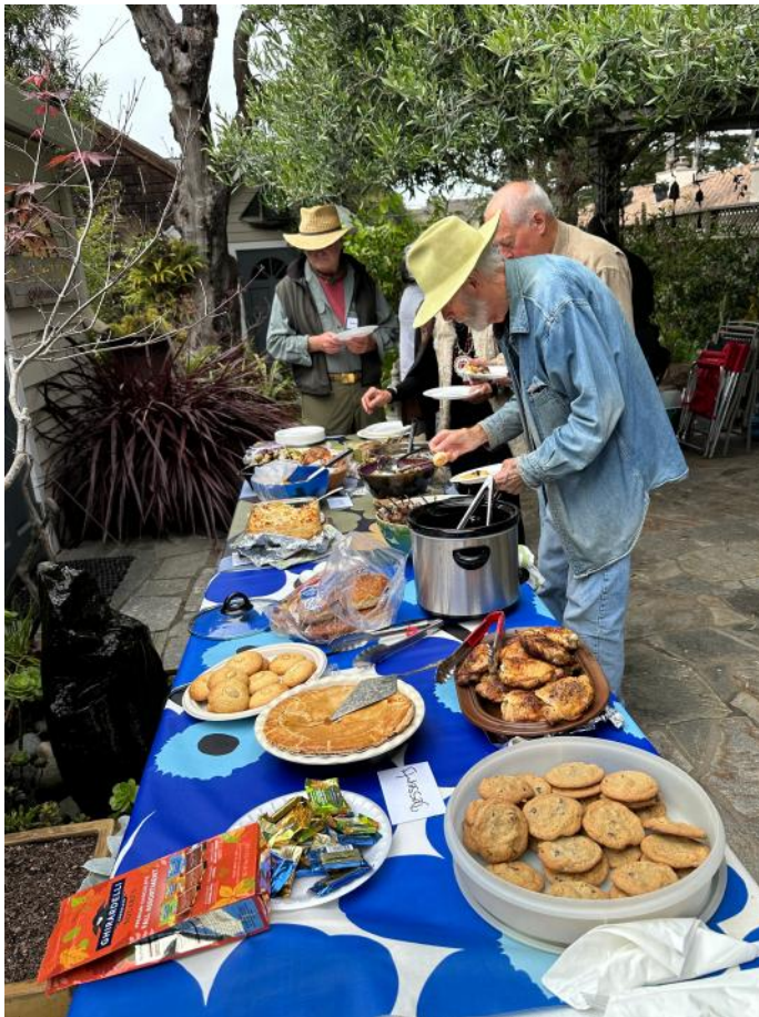
Last years potluck.