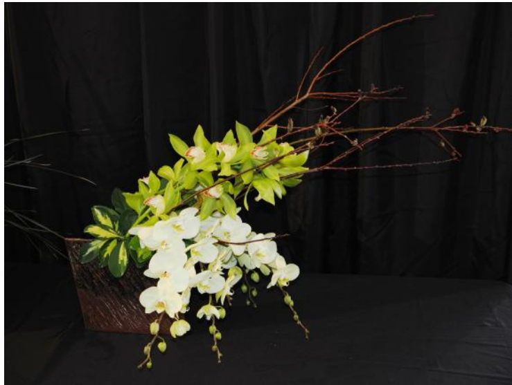
The Santa Barbara show also has orchid themed floral arrangements and art