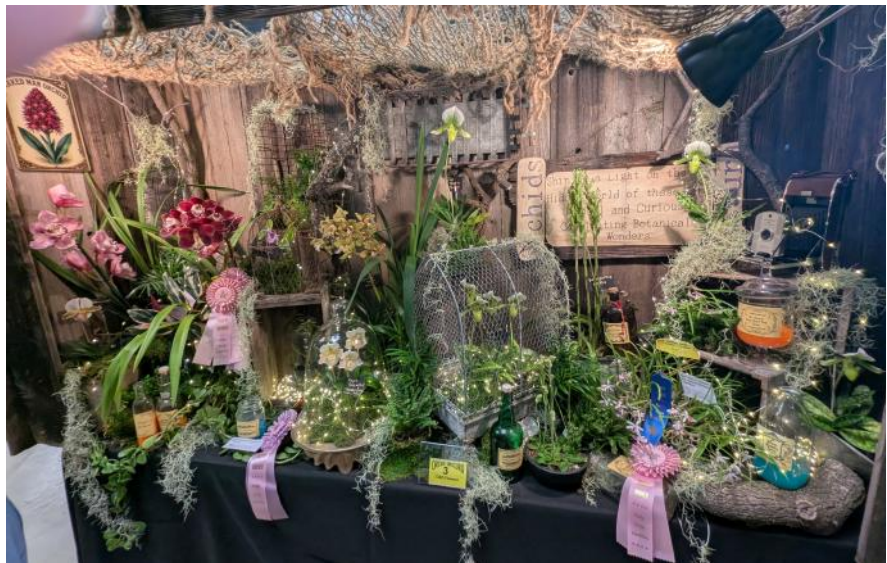
Top left: The always amazing Bay Area Pleurothalid Alliance Wardarian Case