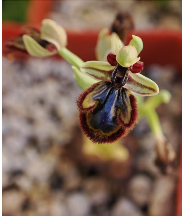
Ophrys speculum a European terrestrial on John's porch. It is pollinated by male Dasyscolia ciliata wasps who are lured in by the flowers resemblance to the female wasp. A classic pseudocopulation pollination method.