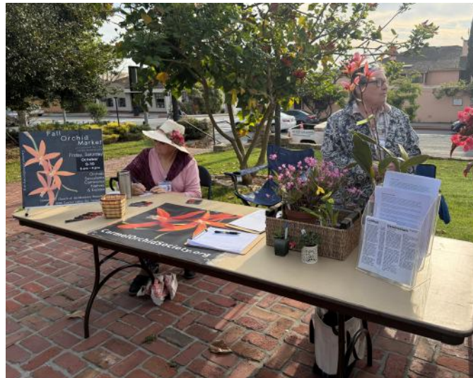
The COS table at Cutting day on March 21st.